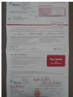
Racketeering and piracy.jpg 1580K