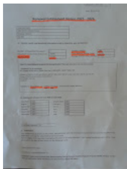
Fraud in Subsidy Entitlement.jpg 1399K